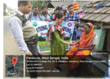
Swachh Bharat Aiviyan (Spreading Awareness for Cleanliness) in the Adopted Villages