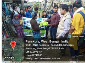
Distribution of Mosquito Nets among the People of the Adopted Villages