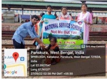
Distribution of Foodstuffs among the Street Dwellers