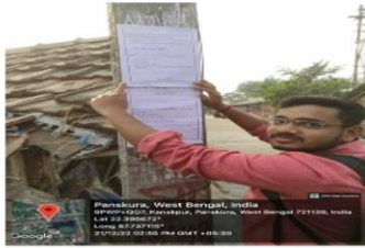
Awareness on Dengue and other vector borne diseases