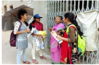
Awareness on Dengue and other vector borne diseases